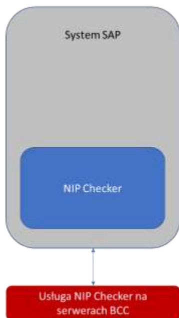
Wariant A. Połączenie bezpośrednie (D)